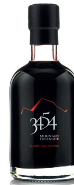
Cherry 3454 Mountain Essence