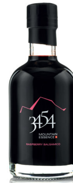
Raspberry 3454 Mountain Essence

3454 Mountain Essence An invitation to creative cooking