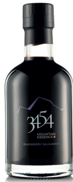
Blackberry 3454 Mountain Essence