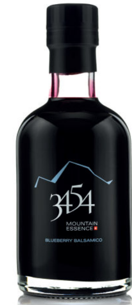
Blueberry 3454 Mountain Essence