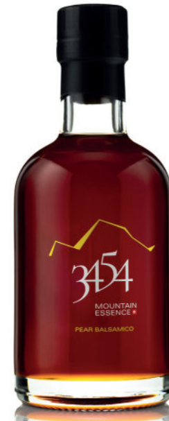
Pear 3454 Mountain Essence