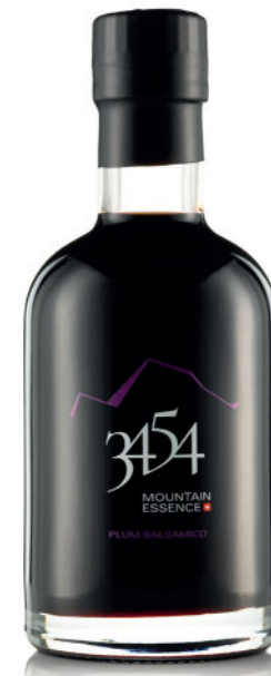
Plum 3454 Mountain Essence