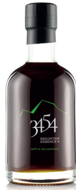
Apple 3454 Mountain Essence