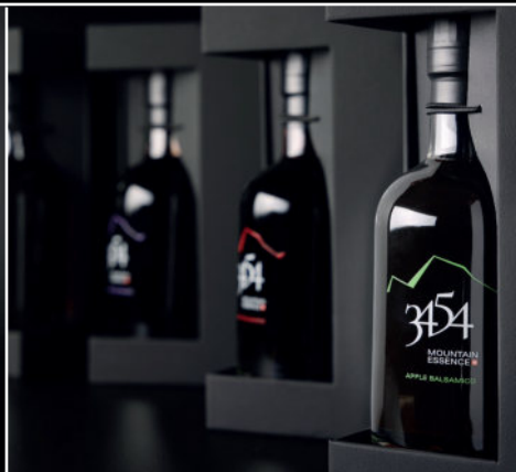
3454 Mountain Essence Gift box with four individually selected balsamicos. The pleasure experience for unique moments.