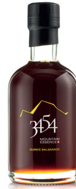
Quince 3454 Mountain Essence