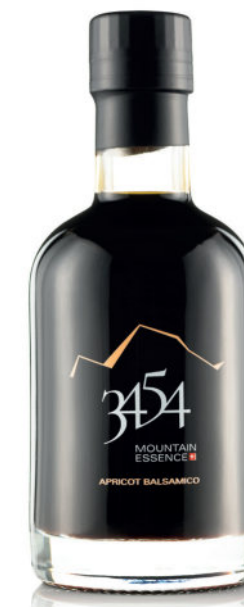
Apricot 3454 Mountain Essence