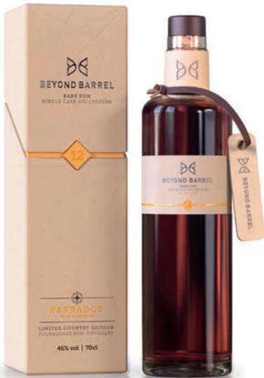
BARBADOS RUM / 12 Y. LIMITED COUNTRY EDITION Foursquare Rum Distillery