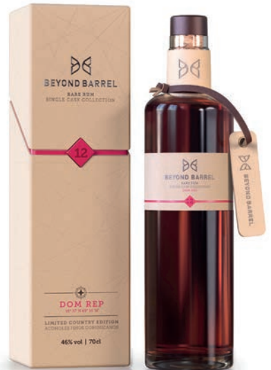
DOM REP RUM / 12 Y. LIMITED COUNTRY EDITION Alcoholes Finos Dominicanos