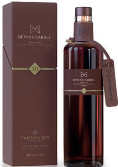
PANAMA RUM / 30 Y. DON PANCHO EDITION Las Cabras Distillery