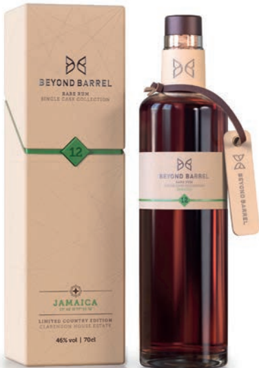
JAMAICA RUM / 12 Y. LIMITED COUNTRY EDITION Clarendon House Estate