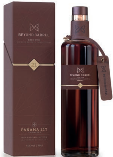
PANAMA RUM / 21 Y. DON PANCHO EDITION Las Cabras Distillery