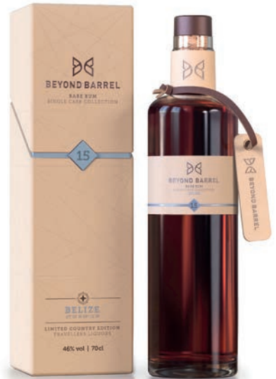
BELIZE RUM / 15 Y. LIMITED COUNTRY EDITION Travellers Liquors