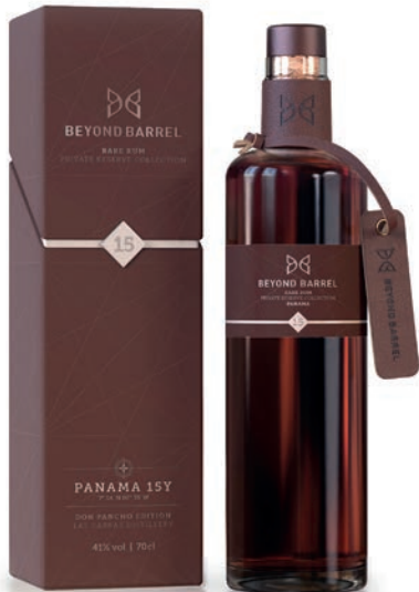
PANAMA RUM / 15 Y. DON PANCHO EDITION Las Cabras Distillery